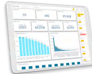
ML Work Orders® brings your facilities maintenance into the Digital Age. New Issues dashboard shown above